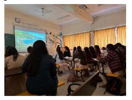
Workshop was conducted for the second and third year students.