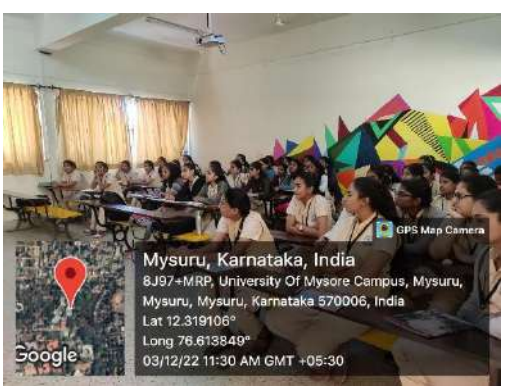
Guest Lecture was organised the second and third year students.