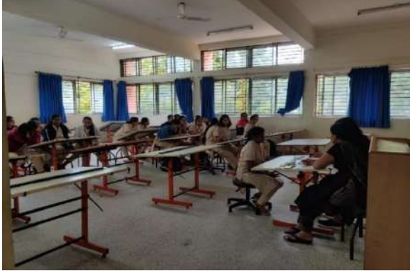
Essay writing competition