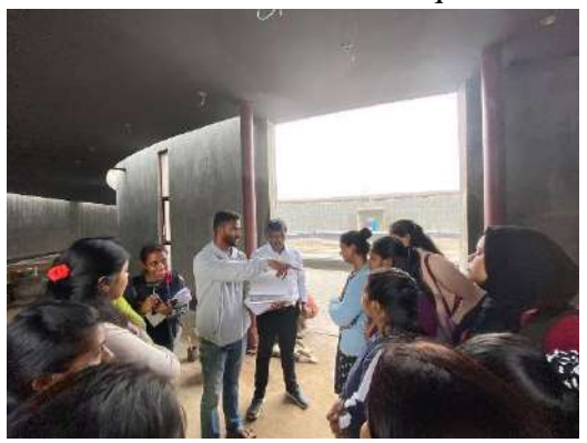
Site Visit to Vishnuvardhan smarak for the students.